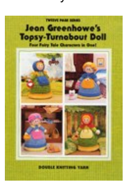
Topsy-Turnabout Doll MacScarecrow Clan