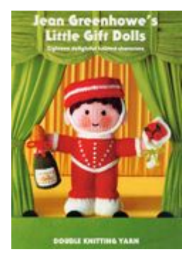
Little Gift Dolls